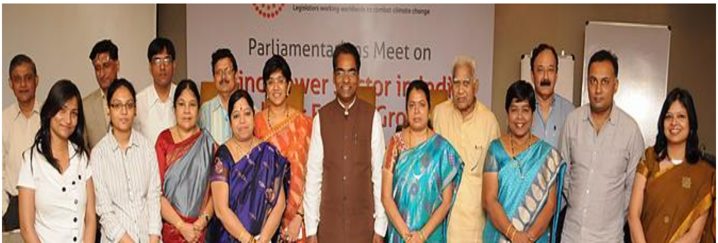
Climate Parliament India group of MPs participating in annual parliamentary workshops to raise awareness and build the capacity of legislators on climate issues.

Piyush Goyal, Union Minister of State for Power, Coal, New & Renewable Energy during his UK visit in April 2016 to strengthen India-UK collaboration on RE development.