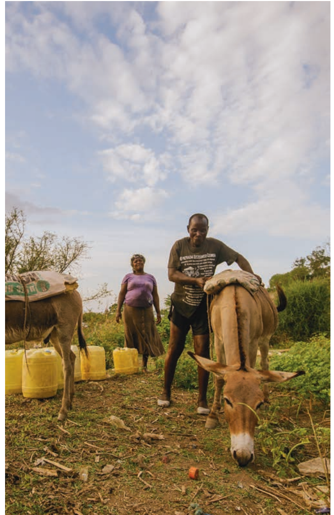
Couple carrying water with donkeys: Utajo Village, Kenya

champions. Encouraging local women to become role models to support and inspire young girls and women is also critical. At the village level, engaging the customary elders and actively opening dialogue with husbands and fathers to champion the gender discussion will help to enable better gender outcomes.