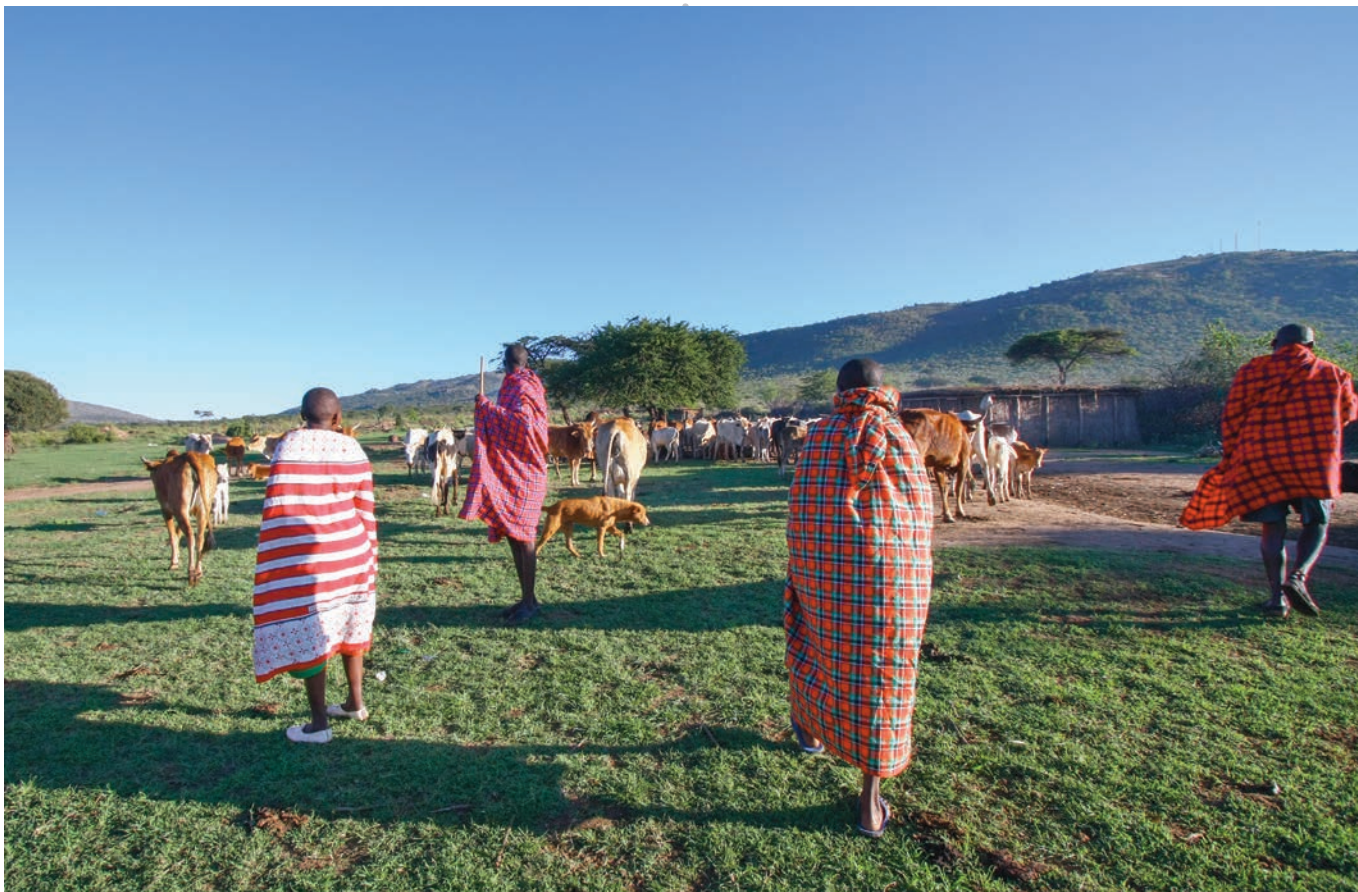
Maasai men go to graze cows, early in the morning and to spend the ritual of Maasai Mara.