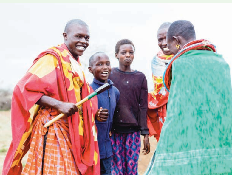
MAASAI FAMILY CELEBRATING AND DANCING, Kenya.

This Policy Brief offers some reflections and recommendations on gender-responsive planning at the county level, given devolution of power to counties in Kenya.