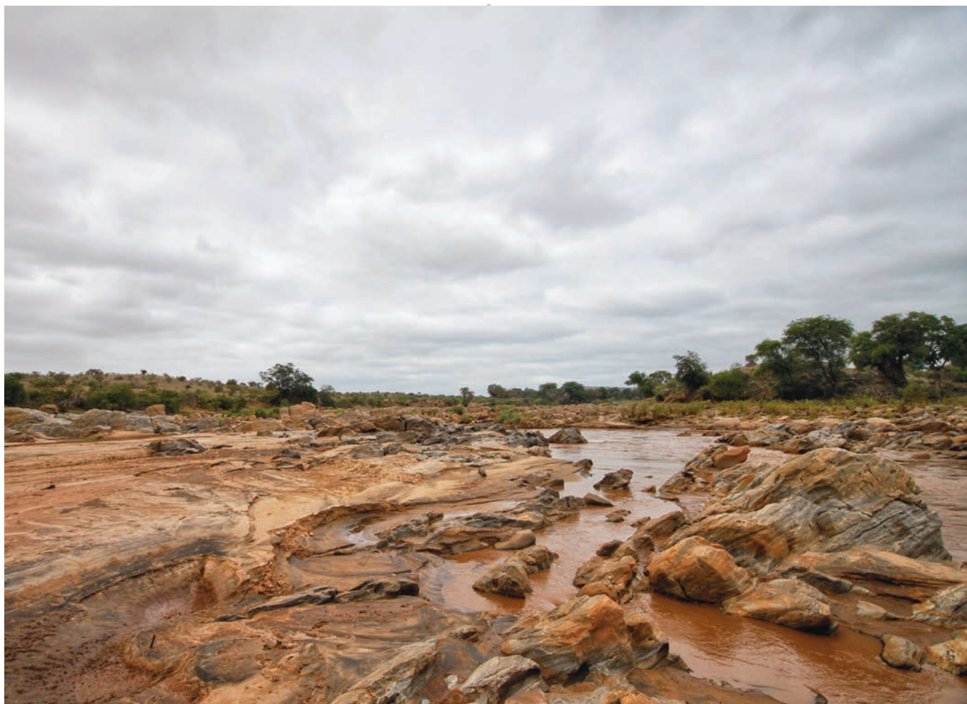
Panorama of Tsavo East National Park in Kenya