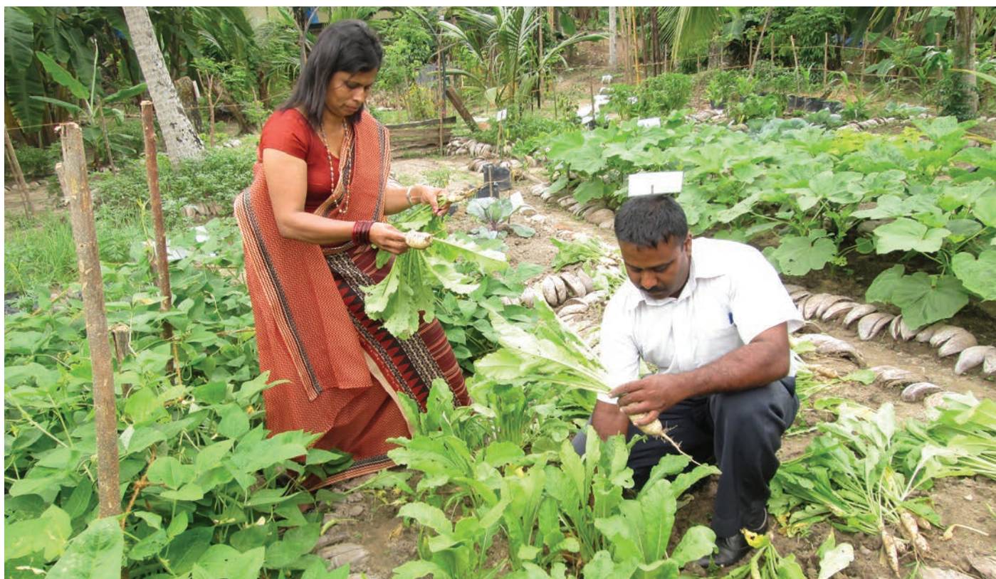
Harvesting time at Kesbewa.

the design and planning of stakeholder consultation and preparation of sectoral actions, plans and implementation strategies has been delayed by the loss of institutional memory after a change of staff in the Ministry of Agriculture.