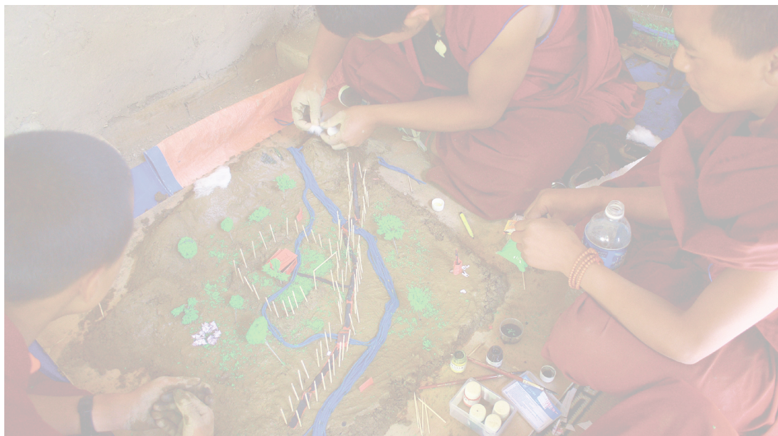
Children making site models