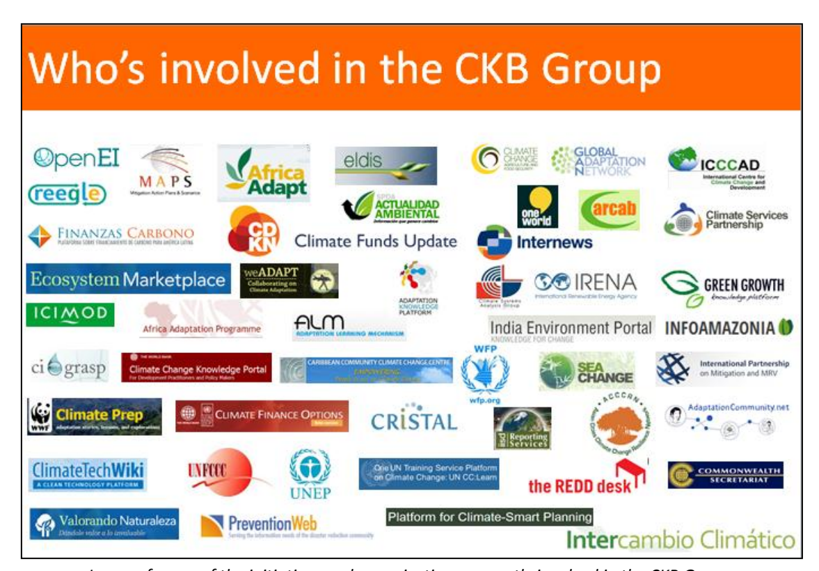
Logos of some of the initiatives and organisations currently involved in the CKB Group

Though progress has been made, evidence of longer term benefits to users is still hard to find. Overall, while the short and medium term objectives of the CKB Group's collaborative work have largely been met, it remains difficult to point to systematic evidence that it is getting easier for the users to find appropriate information, or that this is leading to improved or new action. This underlines to the need for further efforts to track longer term outcomes of knowledge brokering work. This is a challenge which the CKB appears willing to tackle, as part of its on-going learning agenda.