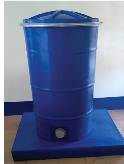
Plastic hermetic silo