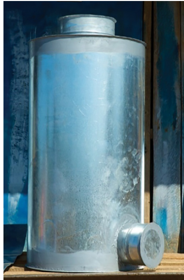
Metal hermetic silo