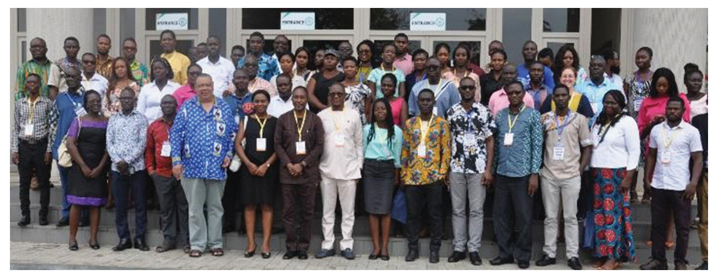
Participants of the event on ecosystem-based disaster risk reduction of floods: Policy response strategies for Ghana, held at the Accra Metropolitan Authority as part of CCPOP 7 Conference, November 2019.

imported non-invasive plant which is used in Ghana for the various purposes mentioned above.<sup>4</sup>