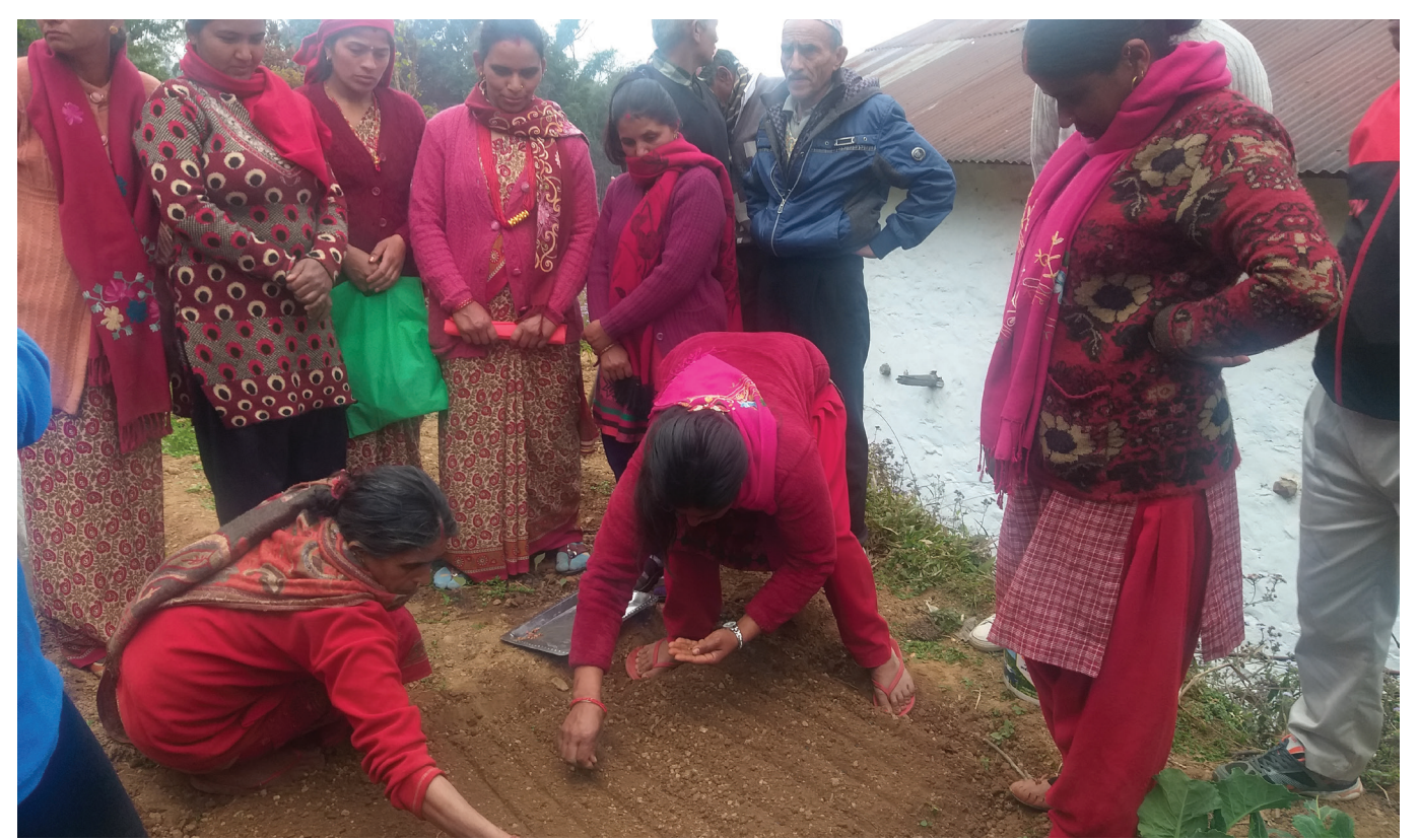
Women farmers teaching sowing techniques to other in Tallo Kudule village, Nepal.

Budgeted activities need to be monitored to identify the impact of various expenditure on women and men to create more equitable delivery of services. The beneficiaries of gender-responsive budgets should be identified and monitored regularly to generate gender-disaggregated statistics for future plans. This information can be used by local governments to enhance women's roles as political actors. The gender impact of