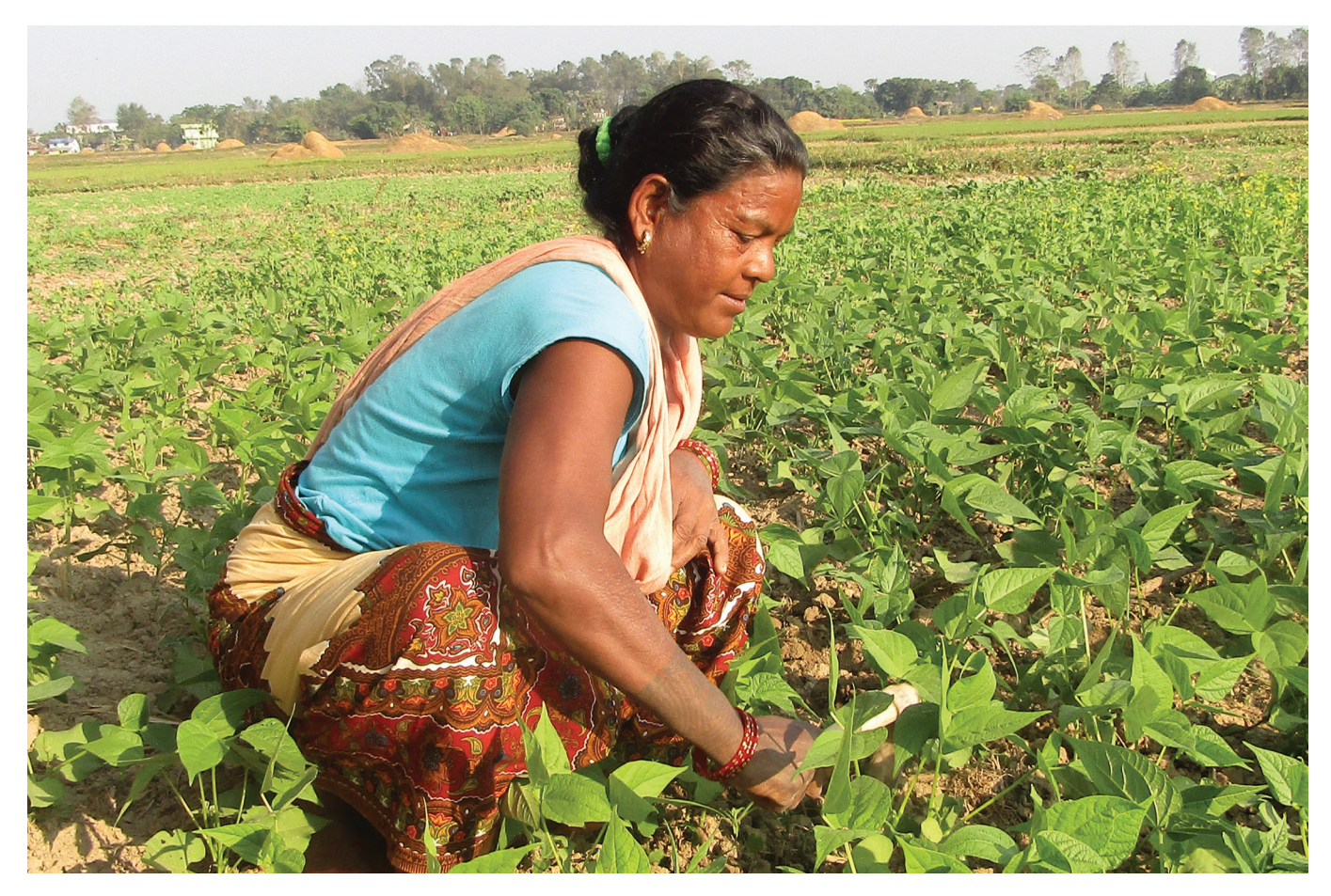
Women in agriculture field, Agyauli village, Nepal.

are categorised as 'directly genderresponsive' (impacting more than 50% of women), 'indirectly genderresponsive' (impacting 20% to 50% of women) and 'neutral' (impacting less than 20% of women).<sup>13</sup> Gender budget coding is used based on the following five indicators: