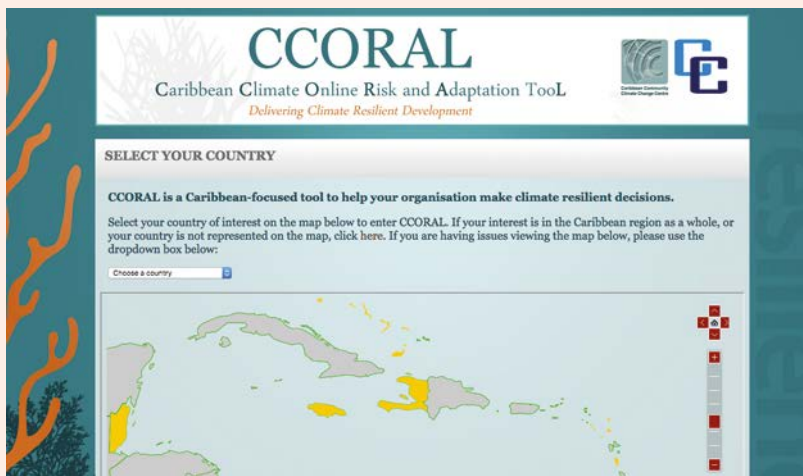
The CCORAL homepage

CCORAL can be applied by all sectors, and is available online at: http://ccoral.caribbeanclimate.bz