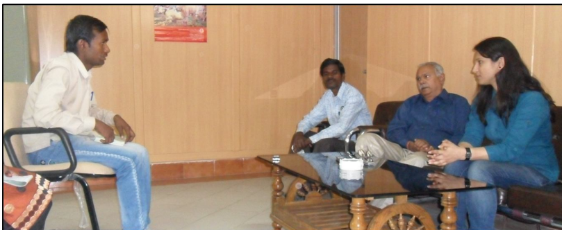
Radio reporters interview a scientist at NRCAF

On their visit to the scientific research organisations namely Krishi Vigyan Kendra (KVK) – the government's agriculture information centre, National Research Centre for Agroforestry (NRCAF) and Indian Grassland and Fodder Research Institute (IGFRI), the reporters gathered a