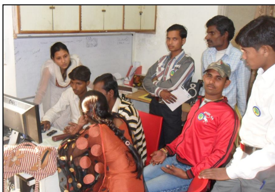
Radio reporters prepare their radio story

After all the three groups came back from their visits to the scientific research organisations and government line departments on Day 3, the lead trainers conducted a debriefing exercise. The participants shared their experiences from the interview sessions with the experts.