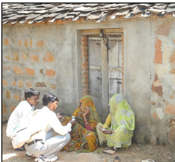
Radio reporters interview village women in Rajapur village

During the two capacity building workshops, the reporters were taken to different villages where they got diverse stories on climate change issues and sustainable adaptation options being practiced on the ground. Following is a list of villages visited and the prevailing situations therein: