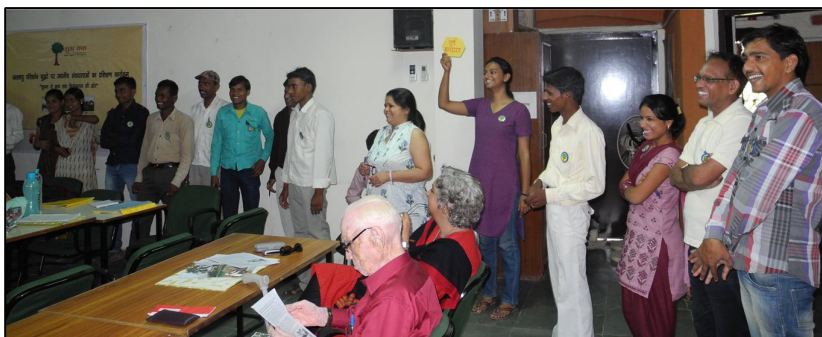
Radio reporters participate in an ice-breaking activity

Before incorporating real world practical experience in the workshop, it was necessary to clear the fundamentals of the participants on vulnerabilities of climate change, potential adaptation options and the objectives of the CDKN – Shubh Kal project. A pre-workshop reporter's survey was conducted to gauge the understanding of climate change issues among the participants.