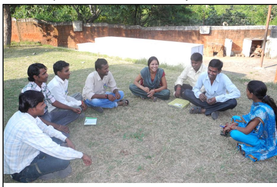
Radio reporters discuss their field visit experiences in the TARA Gram campus in Orchha

This was a great confidence building experience for the reporters because many of them were interacting with scientific experts for the first time. All the reporters were given a chance to ask at least two questions from the expert. During the interview sessions, the experts told the reporters about various scientific adaptation techniques such as water conservation measures, drought tolerant seed varieties, agroforestry concepts, sustainable agriculture practices, fodder varieties for livestock suitable in semi - arid areas, weather forecasting etc. The reporters used this opportunity to ask a lot of questions to the scientists regarding climate change issues relevant to their areas.