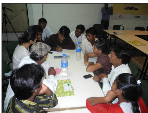
Radio reporters work on questions to ask scientific experts and local government officials

conversation and interviews with the farmers in the different villages and knowledge gained from the preceding day's climate change presentations and discussions - make a list of questions that they would ask the local scientists and the local agriculture department government officials (local policy makers) that they would be meeting the next day. Each of the three groups then presented their list of questions. Reporters from the other two groups were encouraged to give