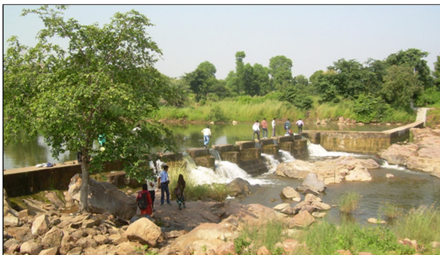
Radio reporters crossing the check dam in Rajapur village to go and meet farmers working in the fields on the other side

In the second half of Day 2 after returning from the field visit, the three different groups presented their experiences and stories that they had collected from the villagers. Thereafter the lead trainers directed them to sit in their respective groups and based on their