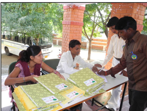
Radio reporters register for the workshop

Two 3 day workshop sessions and training activities were conducted at DA's TARA Gram