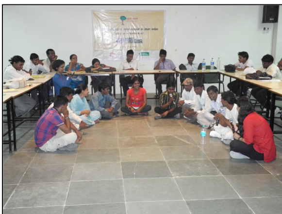
Participants perform a radio play