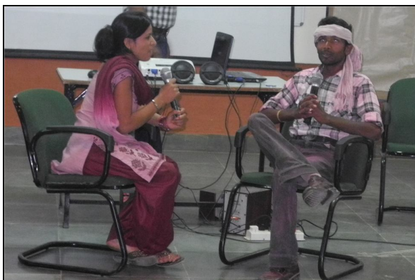
Participants conduct mock interviews

After each interview, the lead trainers as well as other participants provided feedback to help improve the participants' interviewing skills. Some of the feedback that resulted from this exercise is as follows: