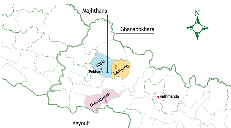
Figure 1. Map of the project pilot districts and sites

flooding and drought in Agyouli; hailstorms, drought and insects in Majhthana; and hailstorms, drought, insects and torrential downpours in Ghanapokhara. Hailstorms and heavy rainfall, which often occur during harvest, are severely affecting crop yields – and household incomes as a result. Climate-smart agricultural practices that address these challenges can reduce the risk of hazards, improve local adaptation capacities and improve crop yields.