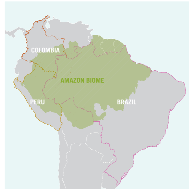
Figure 1. The Amazon biome covering 4,196,943 km 2 (49.29 %) of Brazil, 484,208 km 2 (42.4%) of Colombia and 732,804 km 2 (57.3%) of Peru.

Insights on key policy synergies and trade-offs across the three countries, along with preliminary recommendations to improve water, energy and food security in Amazonia, are summarised in this brief.