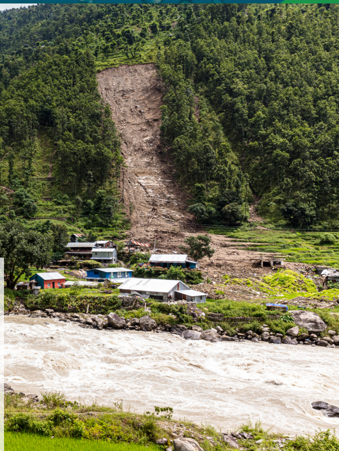
Figure 1: The landslide triggered by an earthquake swept away the water intake pipes