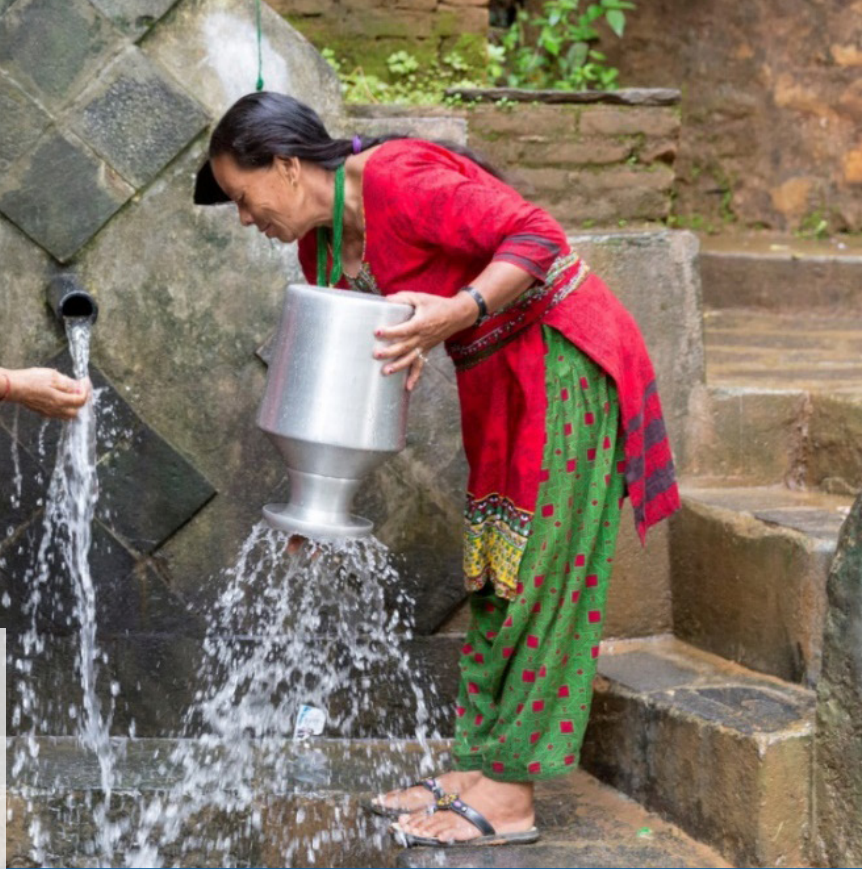
Figure 2: Water source used by women soon after the 2015 earthquake