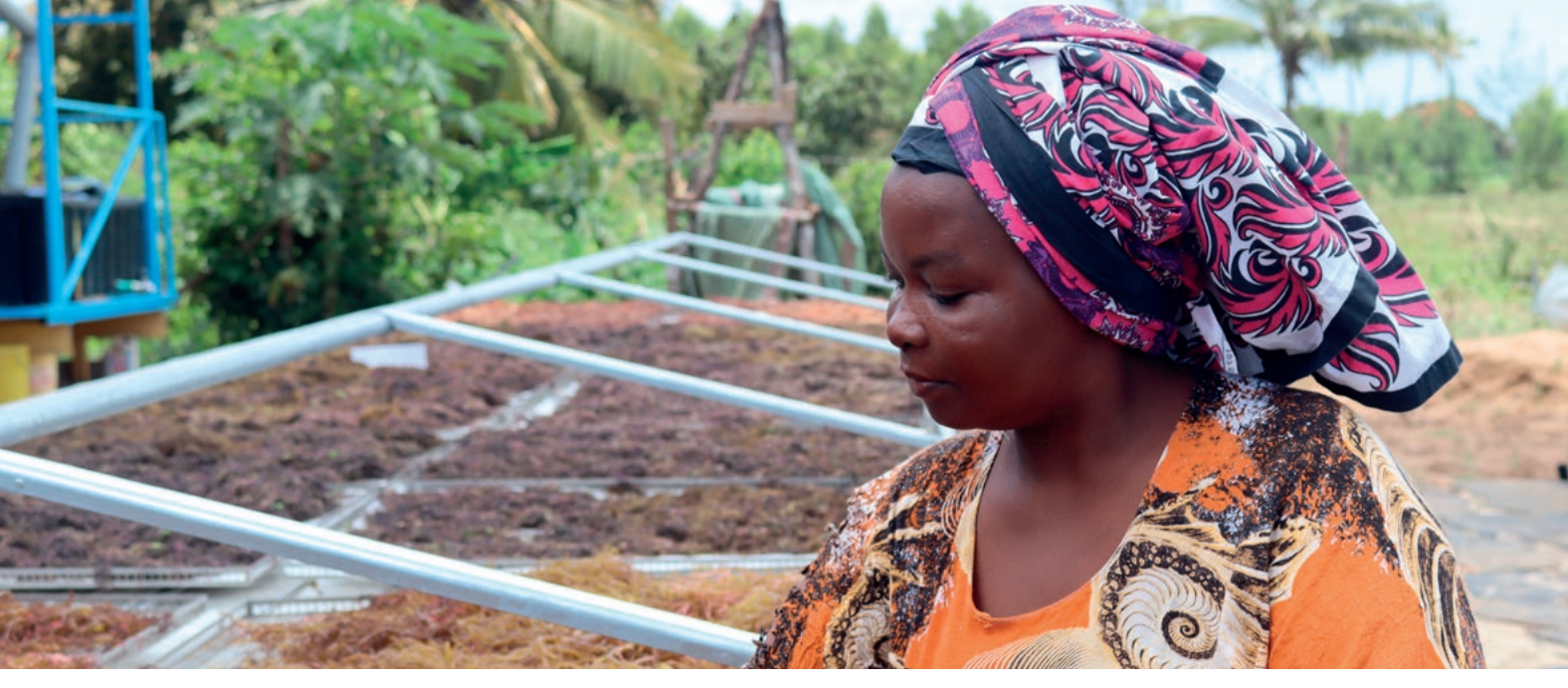
Seaweed entrepreneur at work, Blue Empowerment Project, Kenya.

GLOW projects worked with these innovative businesses to strengthen their gender lens and apply a range of mutually reinforcing women empowerment measures:<sup>4</sup>