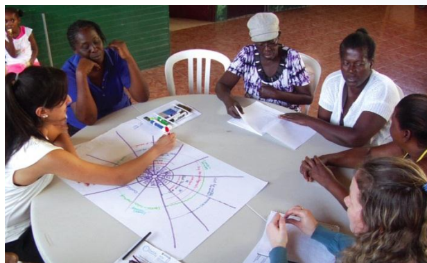
Figure2: Governance workshop

The governance component addresses these disconnect between national adaptation planning processes and their implementation challenge at local levels.