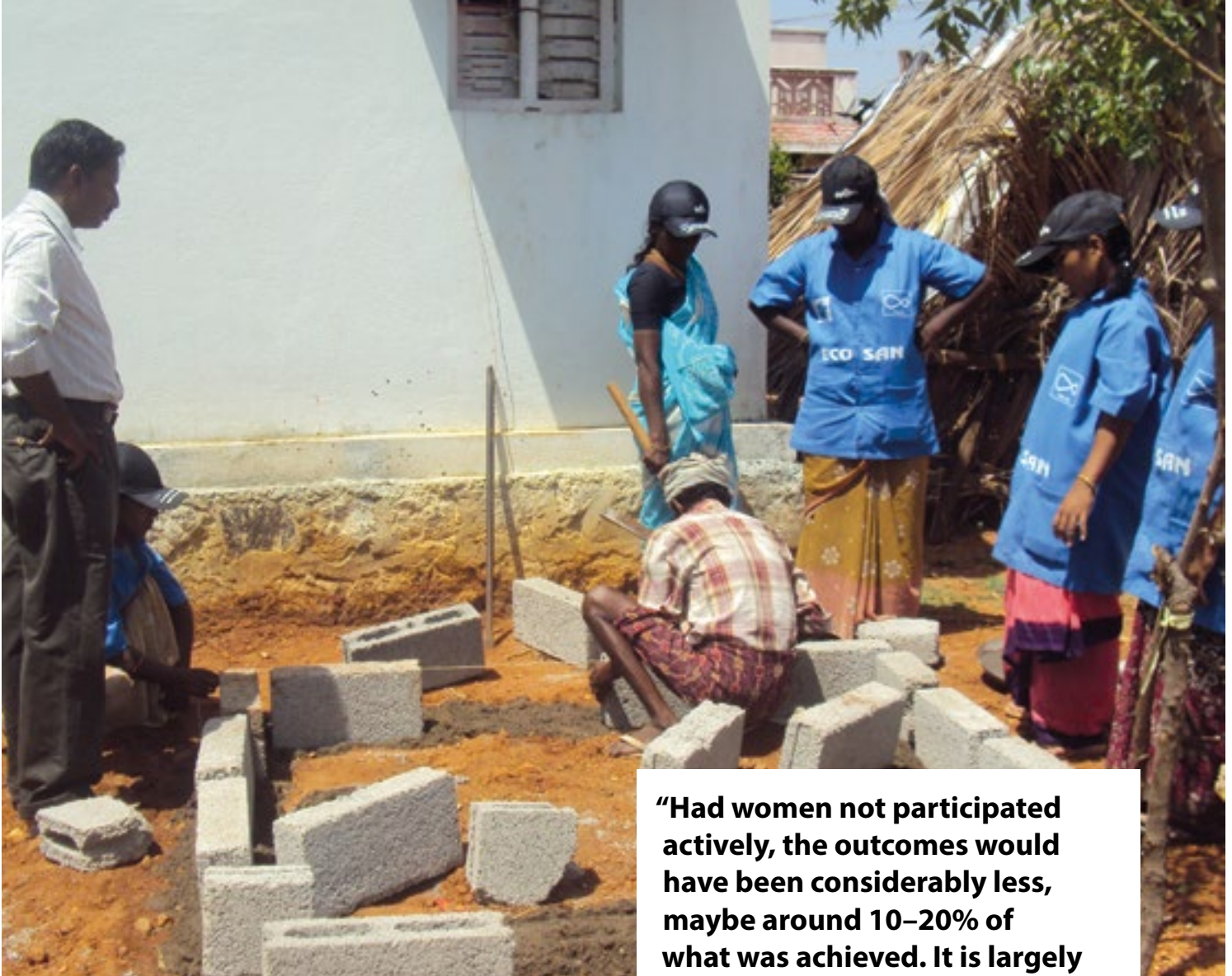
Image: Constructing a toilet | water.org, licensed under CC BY 2.0

“Had women not participated actively, the outcomes would have been considerably less, maybe around 10–20% of what was achieved. It is largely because of women, and also men, that the project has been sustainable so far, as well as effective in resilience building.”