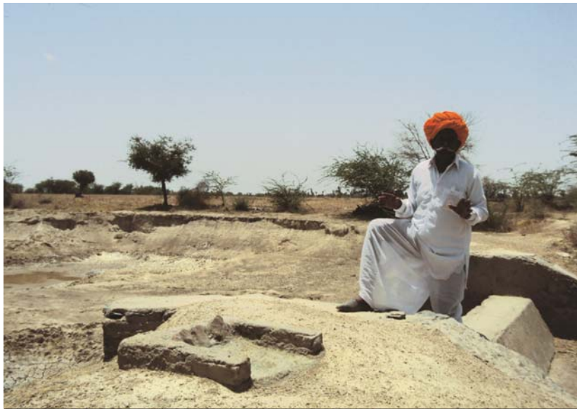
What Biphur needed was water conservation. Hence, rainwater harvesting structures were built, such as the boundary wall here which was made with clay around fields so the water does not run off.

number of rainy days, heavier precipitation, higher run-off and insufficient recharge of the water tables.