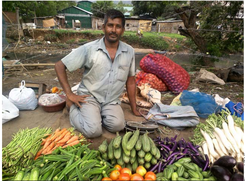
A local vegetable market in Ulubari area of Guwahati where street vegetable vendors are doing their business.

Vending) Act, 2014: It is an act of the Parliament of India, which was enacted to regulate street vendors in Public areas and protect their rights. It was introduced in Loksabha on September 2013 and by Rajya Sabha on 19th February 2014. It received assent by the President on 4th March 2014. The bill came into Action on May 1, 2015. This bill provides social security to the street vendors, regulation of urban street vending or incidental thereto.