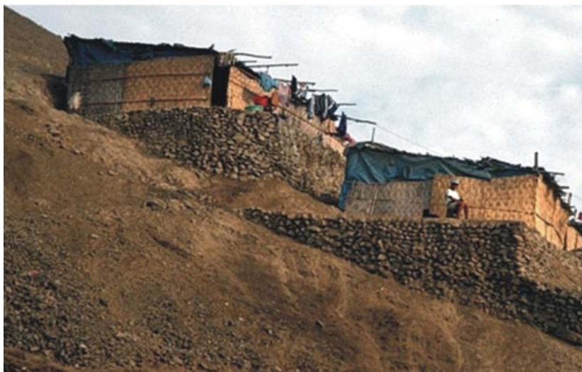
Newcomers in Lima, Peru, construct unstable terraces on dangerous slopes in the outskirts of the city, as no other land is accessible to them. © Theo Schilderman

– Theo Schilderman , Head of Practical Action's Infrastructure Programme, UK