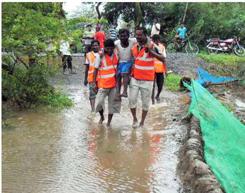
Shelter level task force members evacuating differently abled person to Koithakala shelter in Bhadrak district during Cyclone Phailin .

The much talked about change in terms of community resilience that was in the lime light, was the difference in the results of two similar forms of Cyclones i.e., "Super Cyclone (1999)" and "Cyclone Phailin (2013)". The communities in Odisha have showcased their ability to respond, withstand and recover from the