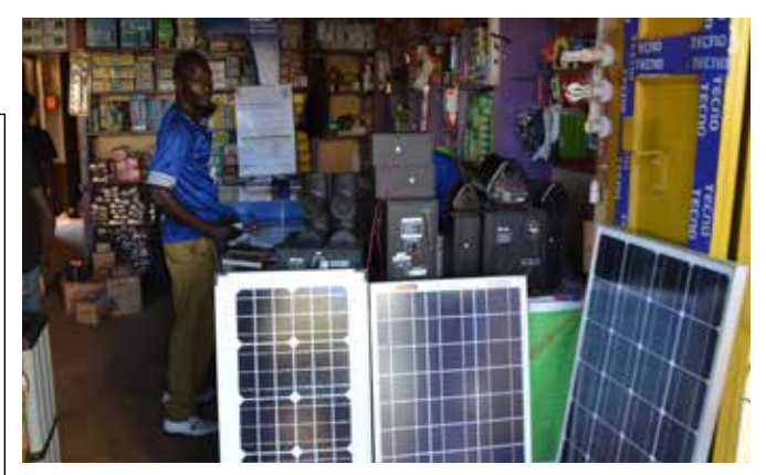
Solar speciality shop in Gulu, Uganda

These networks must be inclusive – attending to the self-defined needs of poor people – if low carbon technology uptake is to be widespread and underpin low carbon development pathways. The result will be to provide 'protective spaces' in which to foster low carbon energy technologies that begin to compete with existing energy regimes (currently dominated by wood fuel, diesel and kerosene).