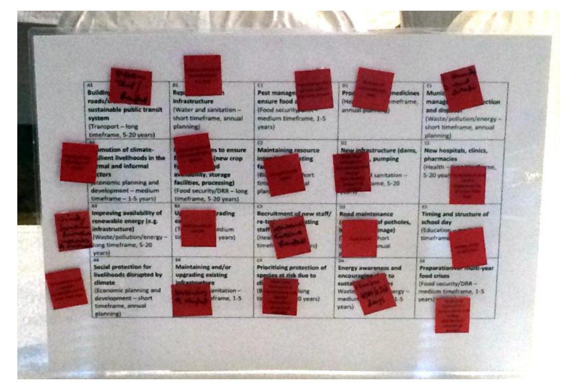
Figure 1. Grid of decision scenarios and climate information needs for urban planning decisions.

Groups were given 1.5 hours to discuss which the most valuable/ most important type of weather and climate information is for each decision, considering various time-frames and planning horizons in order to decide upon the critical source of information for each scenario (see example in Figure 1). Groups were encouraged to keep notes of their discussions and reasons for their final decisions. At the end of the activity the results were transferred onto a large grid matrix (Figure 2). Each group had to nominate a spokesperson to outline and then provide justification for their choice. In order to keep a competitive game format, each decision was scored by a judge who allocated a certain number of points based on the explanation of how the weather and climate information would be useful. In an attempt to encourage thinking "outside of the box", teams that devised their own weather and climate information, as opposed to relying on the pre-made cards, were given bonus points. More about the activity and the scoring system is provided in Appendix D. The outcome of this role play scenario was twofold: firstly it encouraged participants to think about weather and climate information and how it might be useful in different decisions made over different timeframes given the context of climate change; and secondly it elicited a broad theoretical overview of potential weather and climate information needs (which was then refined by subsequent exercises).