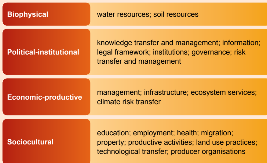
Figure 3. The four dimensions of vulnerability in the AVA project

Integrated, inter-institutional work is of the greatest importance in order to share resources, knowledge and experiences, and thus optimise the results of projects like this one.