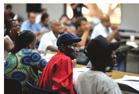
Farmers’ groups attend a climate change workshop at CIAT, September, 2012.