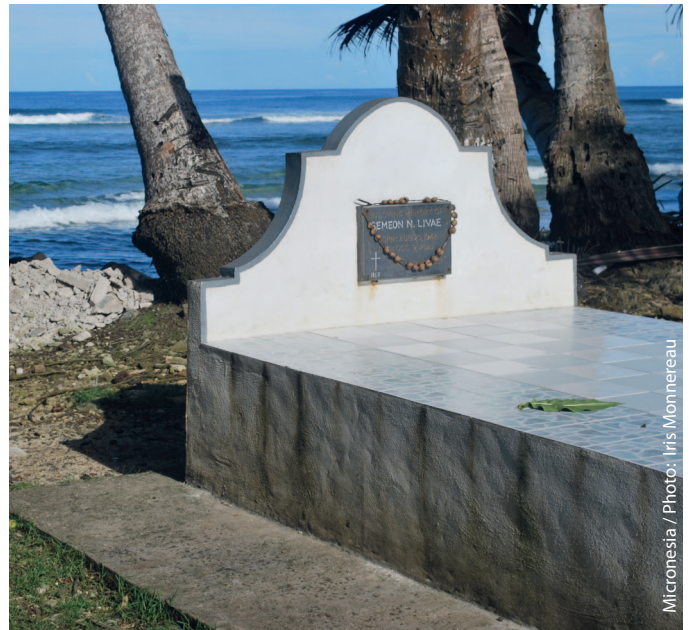
Example of non-economic losses: Sacrificing culture and heritage to the rising seas.

The Loss and Damage in Vulnerable Countries Initiative has four main activity areas designed to both interact with and complement each other. The activities will support LDCs and other vulnerable countries articulate their needs vis-à-vis loss and damage and help create momentum in the loss and damage debate. These activity areas include: