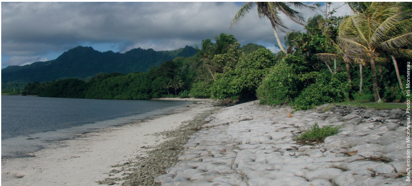
Beach erosion in Micronesia