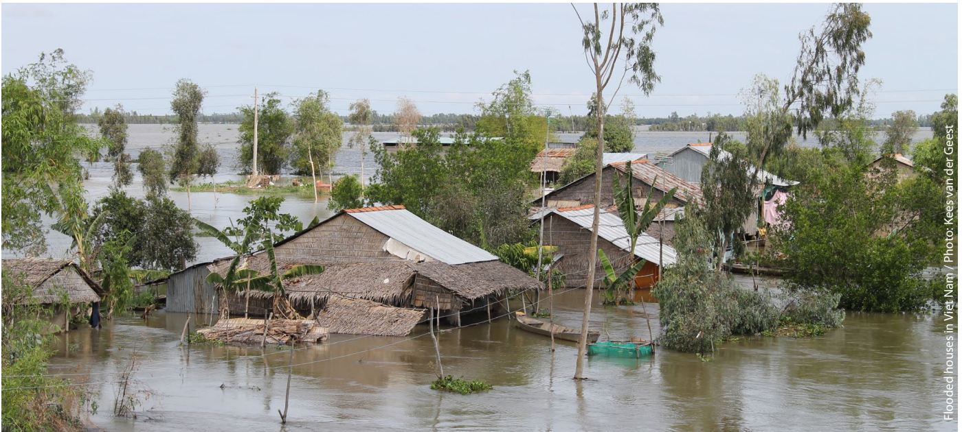
Flooded houses in Viet Nam

Loss and Damage: Adaptation to climate change brought to the extremes?