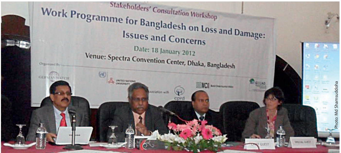
Proactively preparing for the worst: The project explores implication of loss and damage on national decision making in Bangladesh.