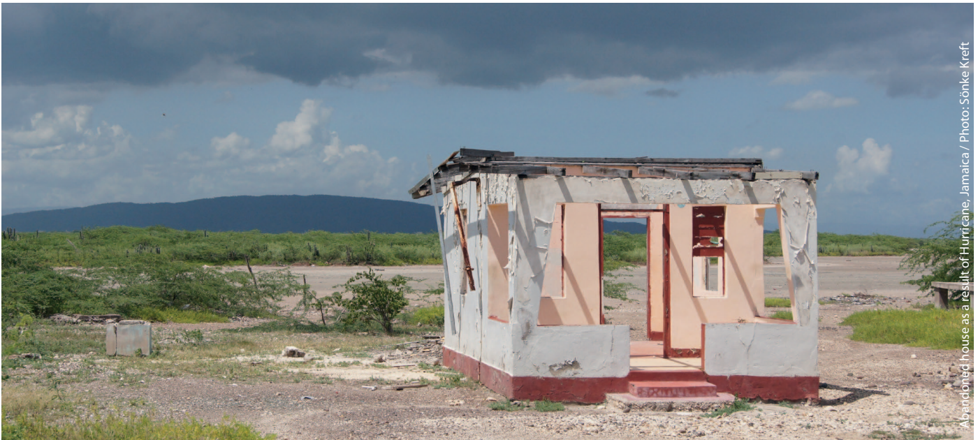
Abandoned house as a result of Hurricane, Jamaica

Climate impacts take increasingly toll among vulnerable people.