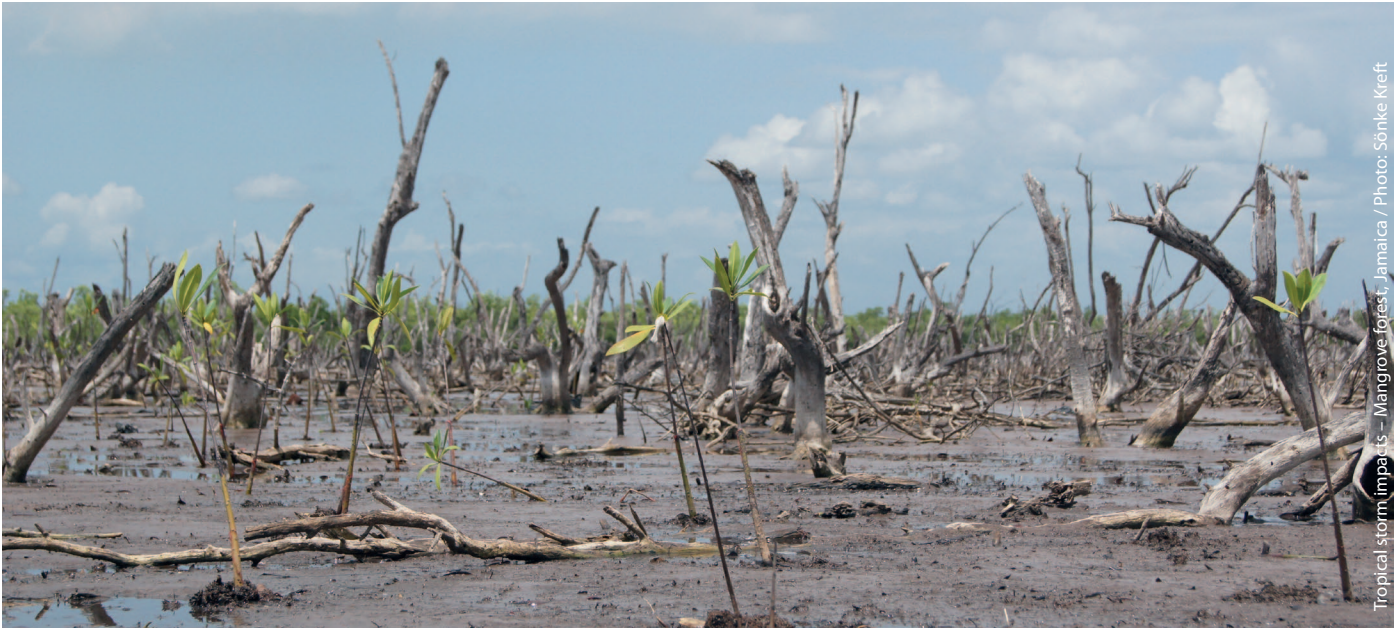
Tropical storm impacts – Mangrove forest, Jamaica

Sea level rise and weather extremes have disastrous consequences for nature and people: SIDS and LDC call for a response of the international community.