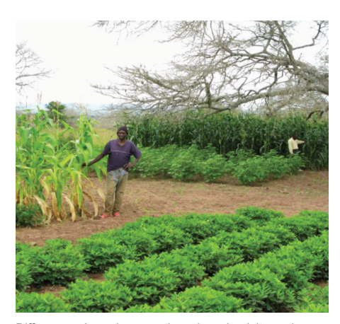
Differences in maize growth and productivity under a Faidherbia albida tree (background) versus outside the canopy (foreground) with the same management practices applied and zero inorganic fertilisation.

The tree species Faidherbia albida shows great promise in increasing maize yields. An indigenous acacia-like tree that is widespread throughout the continent, its pods and leaves are used as protein-rich livestock fodder, its bark as a medicine, and its wood for construction, fuel and charcoal. Particularly promising, however, is a unique feature whereby it drops its leaves at the beginning of the rainy (growing) season and does not begin to regrow them until the following