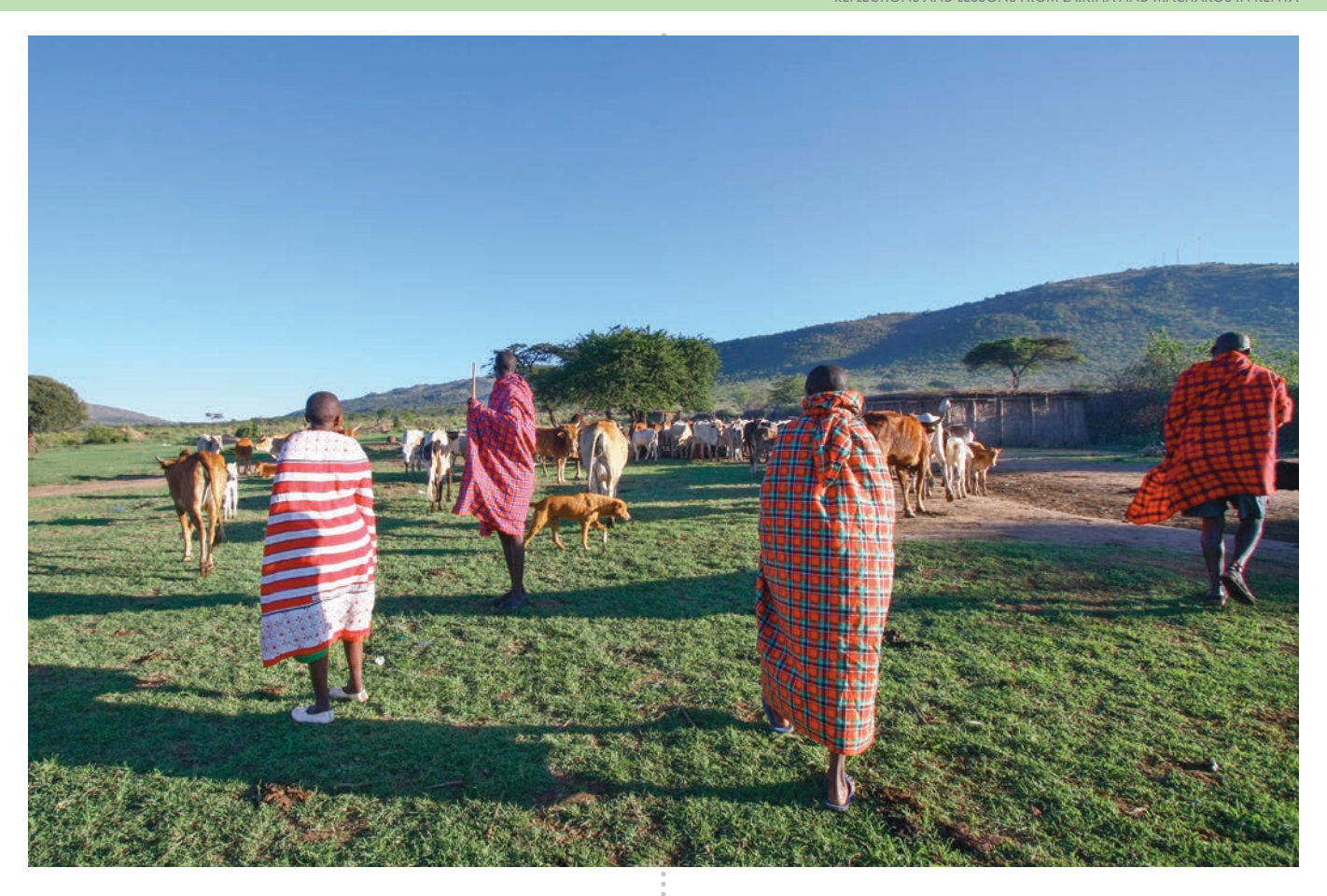
Maasai men go to graze cows, early in the morning and to spend the ritual of Maasai Mara.

Importantly too, the Constitution emphasises public