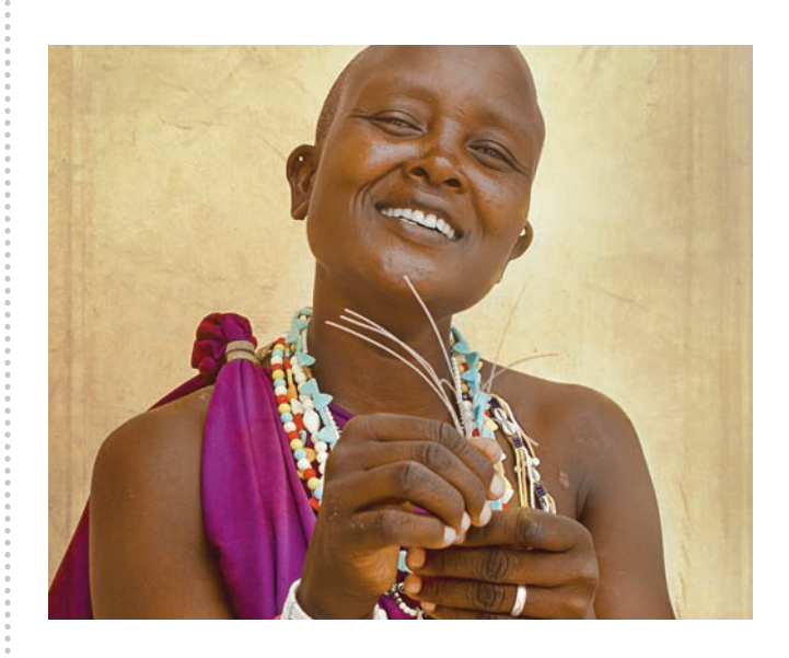
Maasai Woman

The extent to which gender and social inclusion considerations are taken into account at the county level and the outcomes for climate-resilient planning will be shaped by the interplay between the national and county-level institutions. Added to this are challenges related to capacity, funds and political power struggles at the county level. What is clear is that if planning integration challenges are not well addressed within the devolution process, devolution could lead to further marginalisation of the vulnerable, thus undermining the 2010 Constitution's progressive approach to equity and social inclusion of Kenyan citizens.