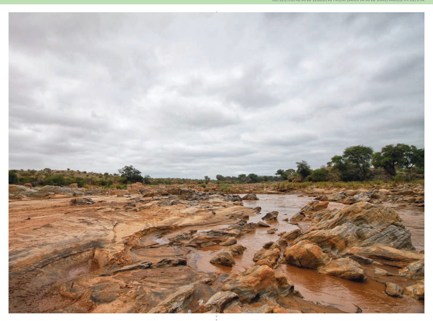
Panorama of Tsavo East National Park in Kenya