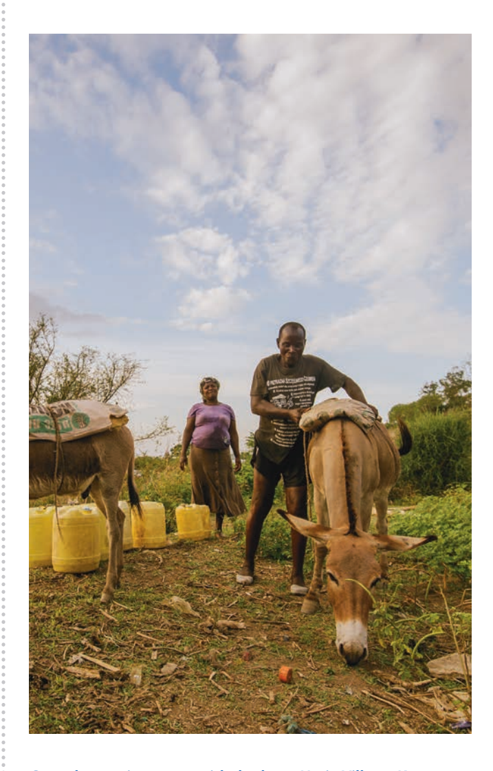
Ccouple carrying water with donkeys: Utajo Village, Kenya

champions. Encouraging local women to become role models to support and inspire young girls and women is also critical. At the village level, engaging the customary elders and actively opening dialogue with husbands and fathers to champion the gender discussion will help to enable better gender outcomes.